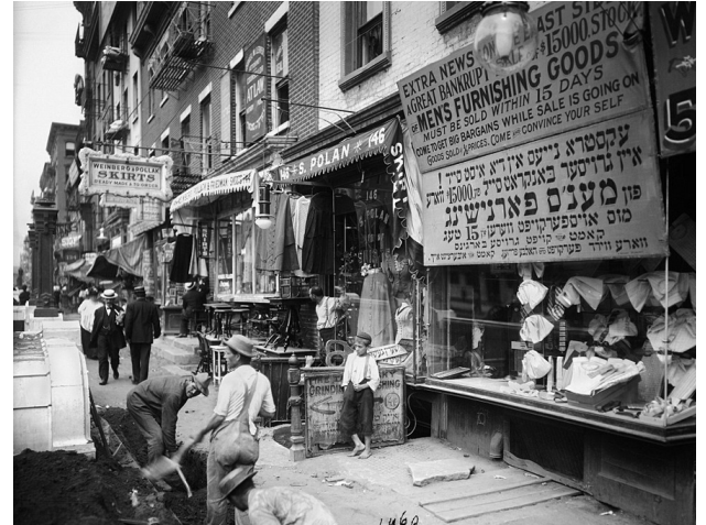
Always moving: Workers dig in Delancy Street on New York's Lower East Side in this photo dated July 29, 1908. The historical pictures released online for the first time show New York in the late 19th and early 20th centuries

http://www.dailymail.co.uk/news/article-2134408/Never-seen-photos-100-years-ago-tell-vivid-story-gritty-New-York-City.html