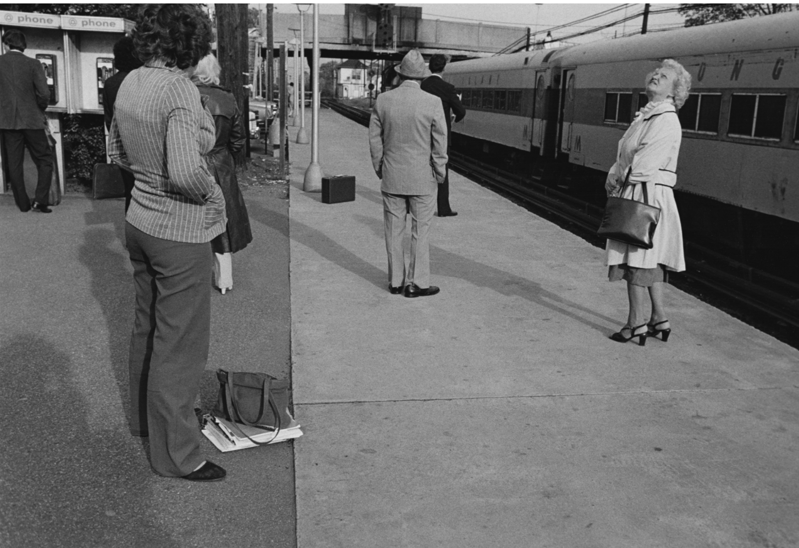
Waiting for Train © Susan May Tell